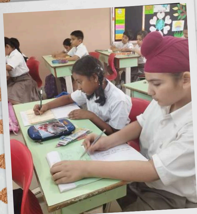
Season Lexicon Card Activity

Students of Grade IV engaged in 'Season Lexicon Card' activity which was designed to help the learners expand their vocabulary and to review and consolidate knowledge about the characteristics and phenomena associated with each season. The learners created a set of cards featuring words and phrases related to seasons. They used magazine cut-outs, illustrations to make their cards and presented their work, explaining the chosen vocabulary and the significance of their illustrations.