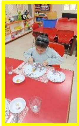
Table manners are essential for creating a positive impression and fostering respect in social and professional settings. They reflect courtesy, discipline, and cultural awareness.